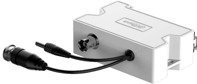
DH-PFM811-C PD End (Power device)