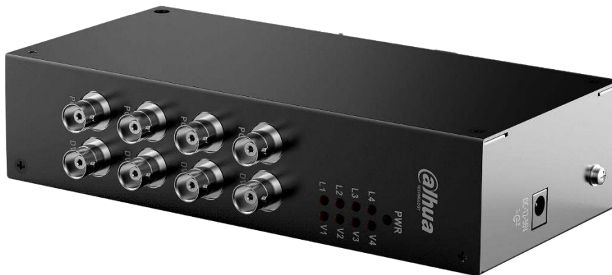
DH-PFM811-4CH PSE End (Power sourcing equipment)